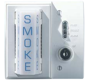
SSK451 with PS24LOW strobe and PS12/24 LENS lens