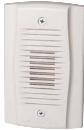
MHW UL S4011