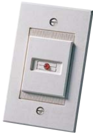
RA400Z UL S2522