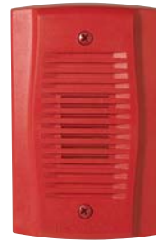
MHR UL S4011