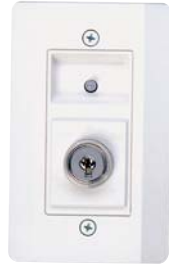
RTS451KEY UL S2522