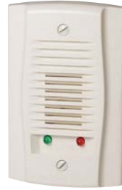
APA151 UL S4011