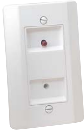
RTS451 UL S2522

System Sensor provides system flexibility with a variety of accessories, including two remote test stations and several different means of visible and audible system annunciation. As with our duct smoke detectors, all duct smoke detector accessories are UL listed.