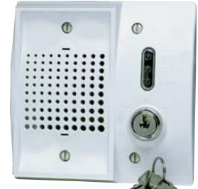
SSK451 UL S2522