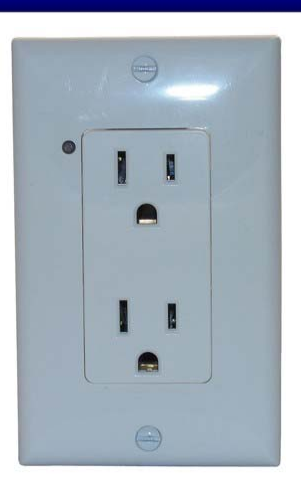
Anywhere Virtual Receptacle Outlet Remote Lighting and Appliance Control Model: URD-V0