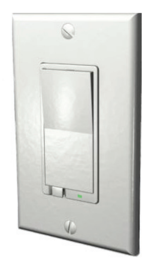
Supplied with decorative switch plate

Radio Frequency (RF) Controlled, 500W, 120 VAC, Wall Mounted Dimmer