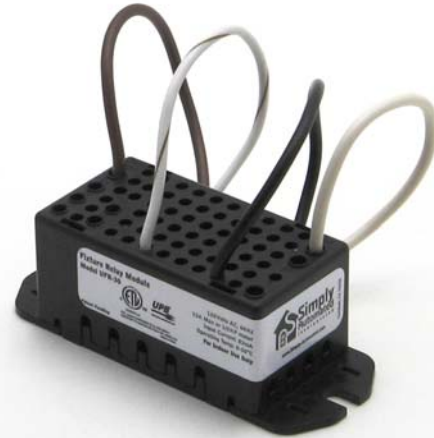
Model UFD – Wire-in Fixture Module – Dimming Model UFR – Wire-in Fixture Module – Relay